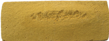
Cobblestone Single Skin 200mm Block

Build something beautiful with Timbercrete's unique, energy efficient signature block, offering features and benefits that will astound you.