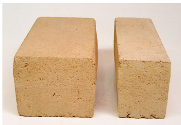
Cobblestone Series 200mm thick (left), 120mm thick (right)

The 200mm thick single skin Cobblestone Series Block is our most popular and has become our unique signature block. Each block is individually hand crafted, with slight variations of curved faces and dimensions inherent in the hand-made process. This variation is intentional in order to create the unique cobblestone appearance with the charm and character of the old world. The mortar thickness will also reflect this variation, ranging from 10mm to 20mm.