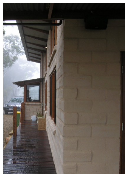
Lightly Bagged finish